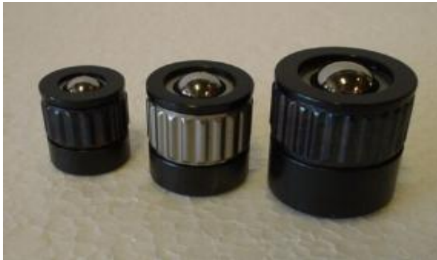
Above: EKM NY

Warm die tables? The spring-loaded balls, standard design, endure a working temperature up to 80 degrees Celsius. If requested, we can deliver a HT (High Temperature) model enduring up to 200 degrees Celsius continuous working temperature. The lifting capacity has to be reduced with 25% compared to standard.