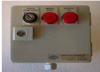
Control- box -1E

Advantages: Compact design. Absolutely maintenance-free.